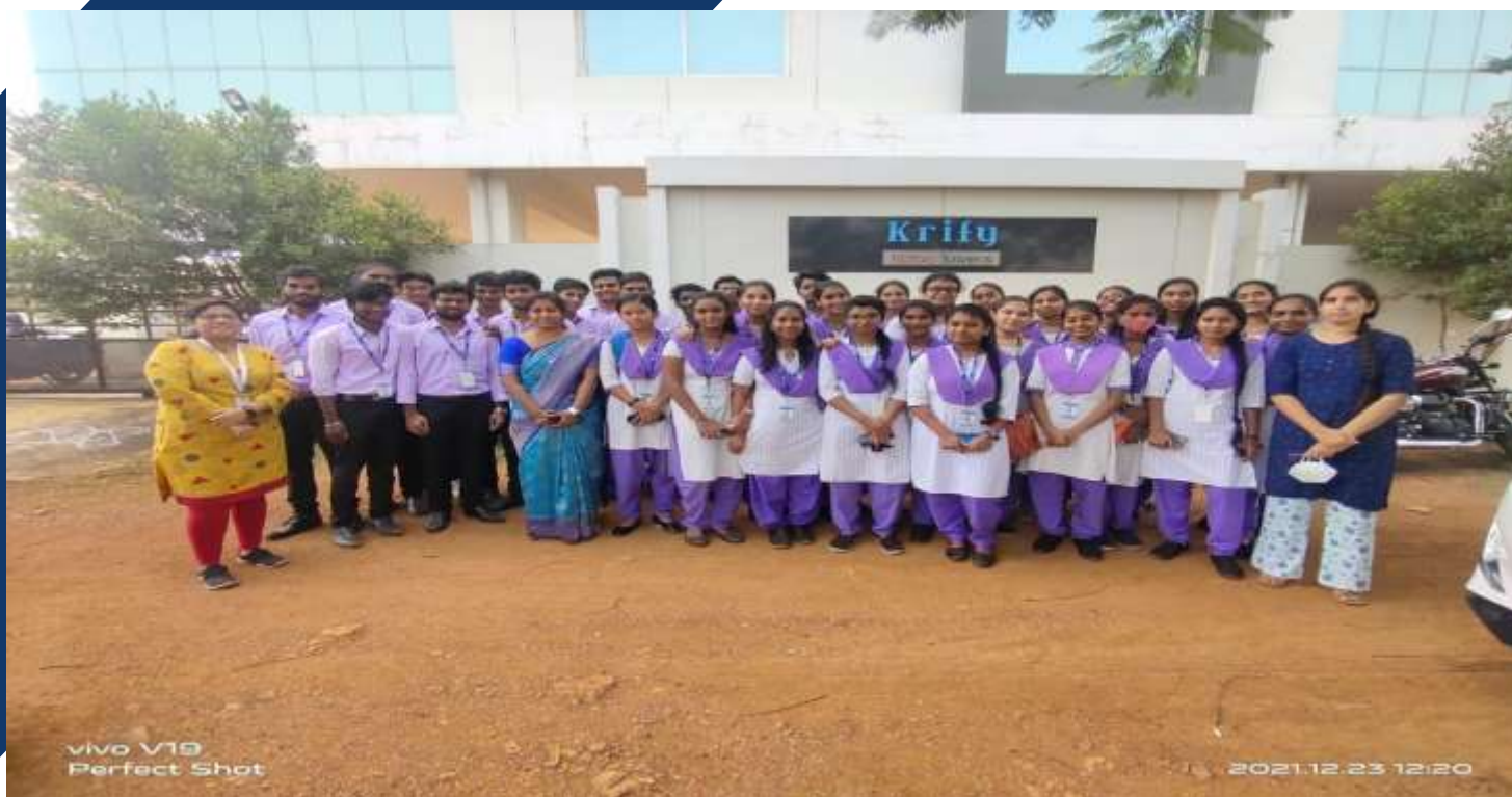
Photos during Industrial Visits II CSE – A, B and C Sections